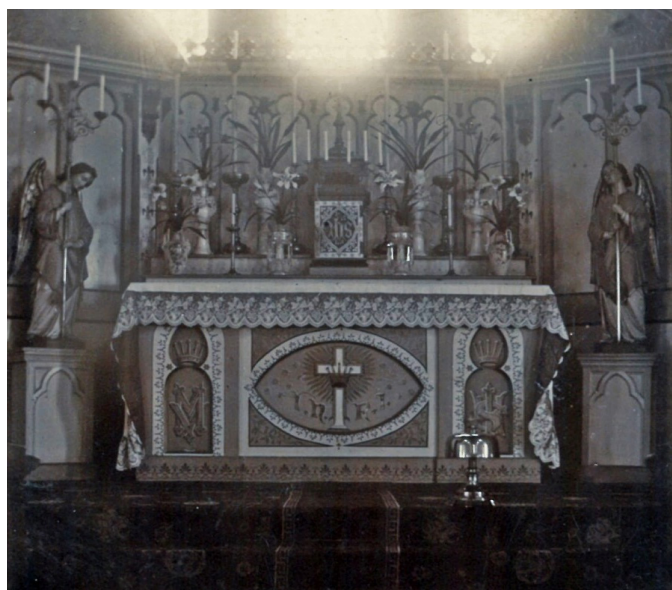
The Angels stand guarding the St Kilian's Altar.